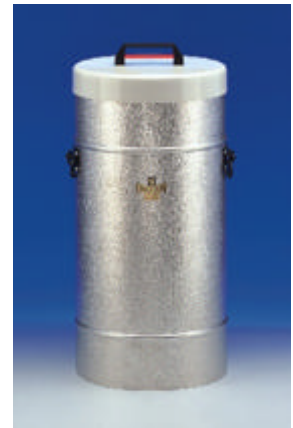
Dewar flasks 33 to 35 CAL with side grips