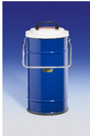
Dewar flasks 30/4 to 32 C with handle