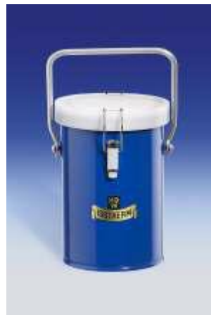
Dewar flask 26 B