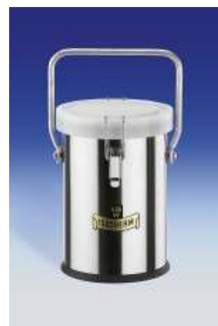
Dewar flask 26 B-E