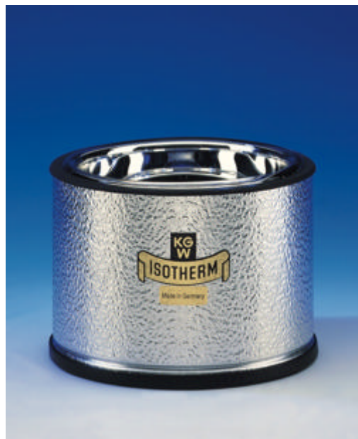
Dewar flask SCH 9 CAL